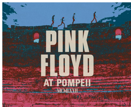
Pink Floyd's Pink Floyd at Pompeii MCMLXXII