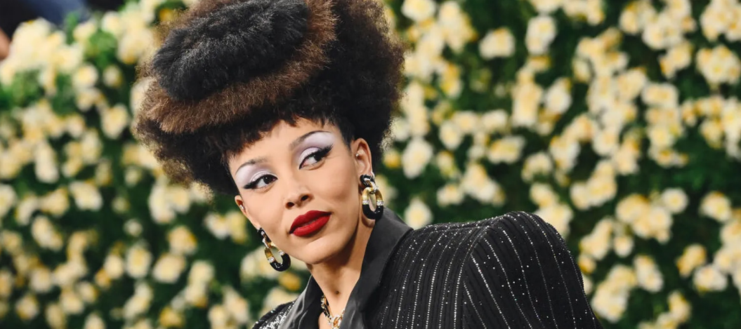
Doja Cat at The 2025 Met Gala