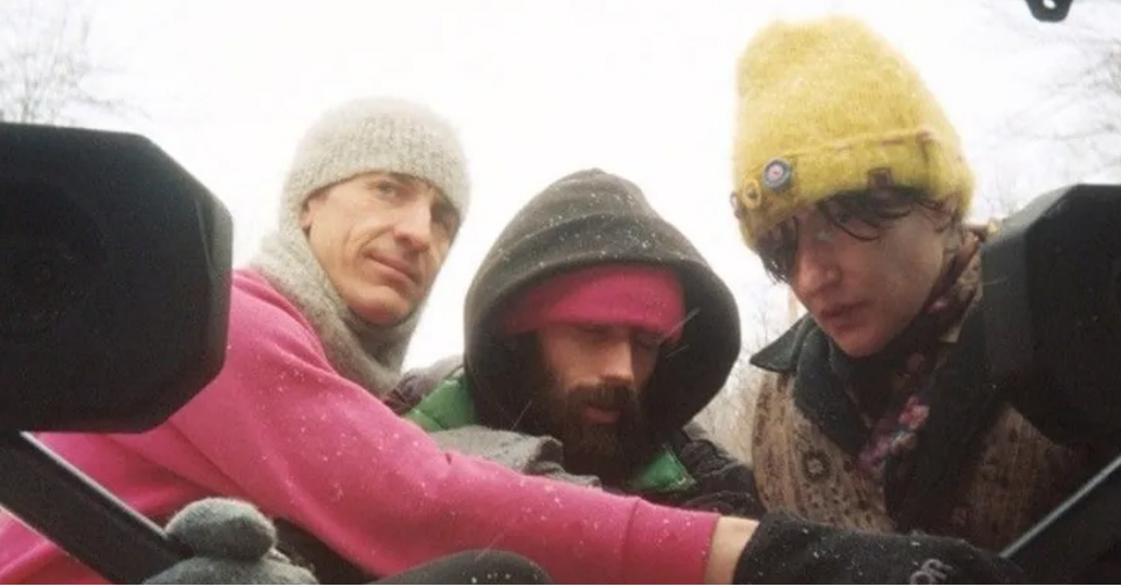
Big Thief