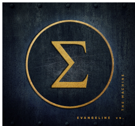
Eric Church's Evangeline vs. The Machine