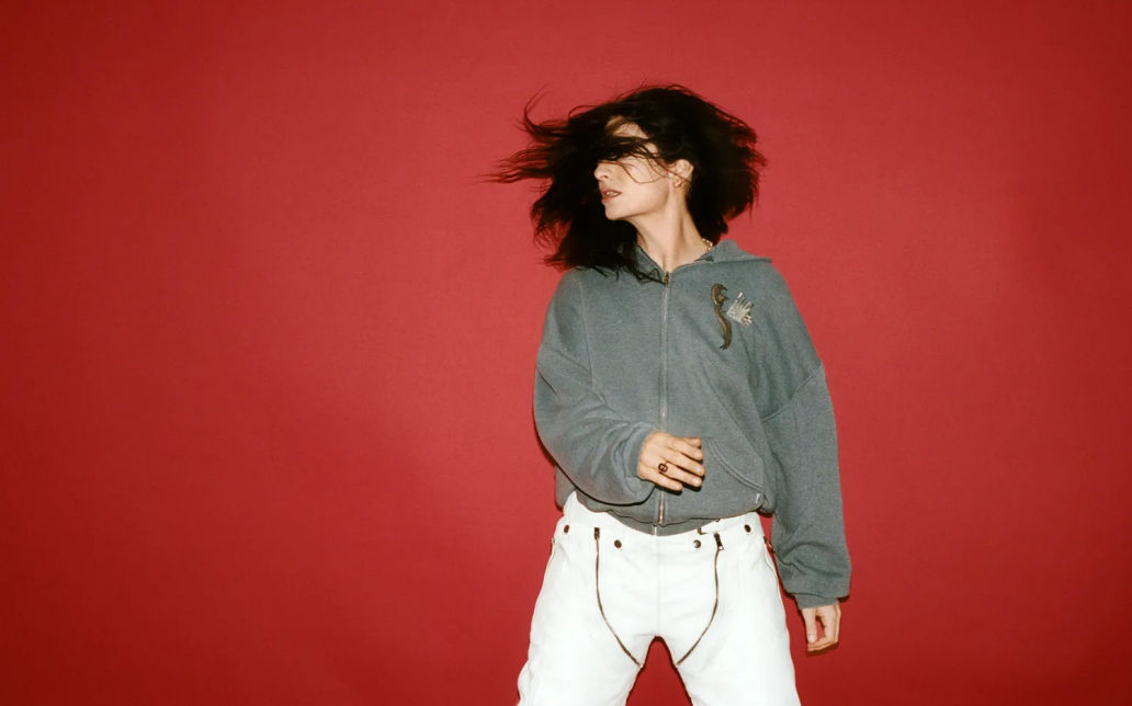
Lorde