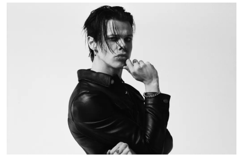
YUNGBLUD

In April, Doja previewed a 16-song tracklist for Vie , including songs titled “Take Me Dancing,” “Aint News,” “Slow Burn,” “Wood Holly,” “Did I Lie” and “Appreciation.” At press time no release date for Vie has been announced.