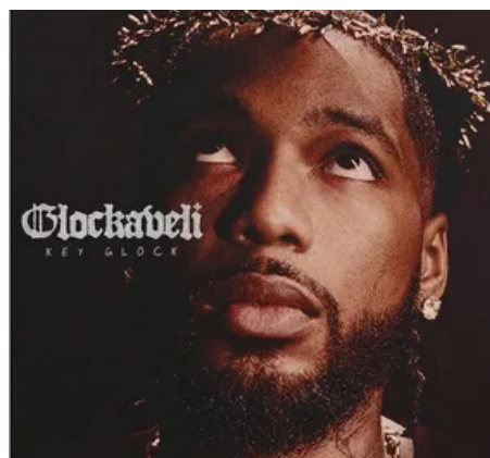
Key Glock's "Glockaveli"

but also an audio reissue this month on vinyl and CD, and for streaming and digital download. The 11-track, two-disc set includes early Floyd classics like “One of These Days,” “Set the Controls for the Heart of the Sun” and a version of the epic “Echoes” split into two separate parts, both of course lasting over 10 minutes.